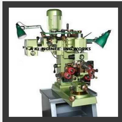
Chain Cutting Machine