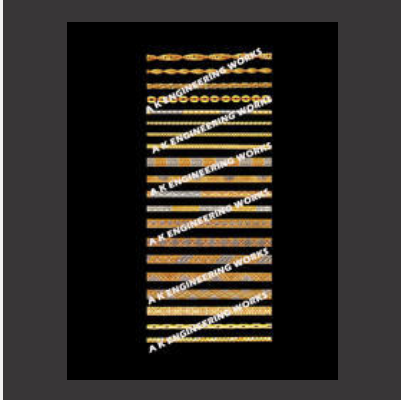
Double Head Chain Cutting And Faceting Machine Sample