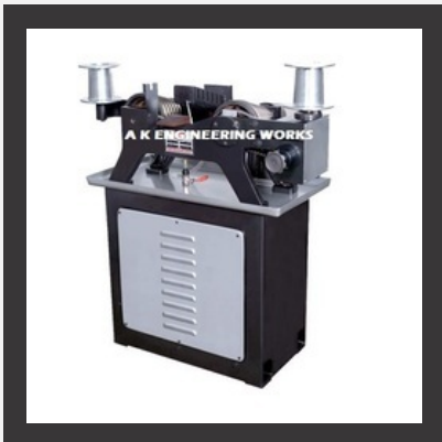
Jewellery Wire Drawing Machine for Jewellery Industry