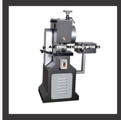
Chain Hammering Machine