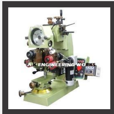
Automatic Chain Cutting Faceting Machine