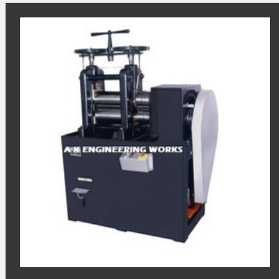
Single Head Heavy Duty Sheet Rolling Mill