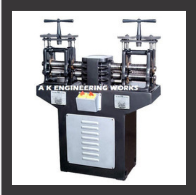
Double Head Wire Rolling Mill