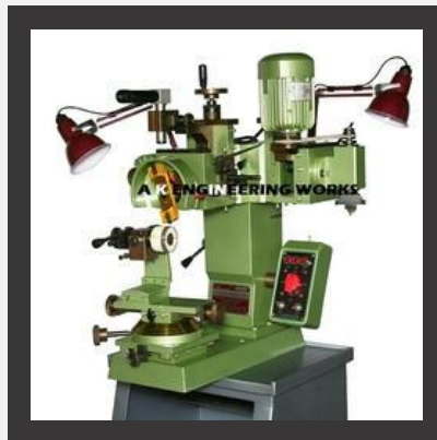
Double Head Zig Zag Bangle Ring Faceting Machine