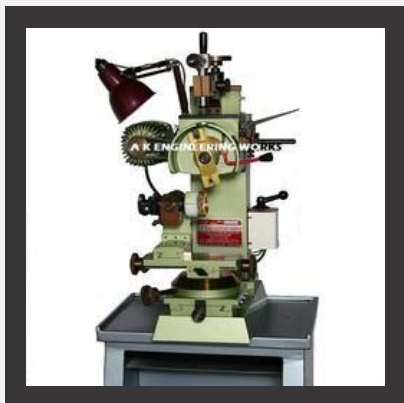
Single Head Bangle Ring Faceting Machine