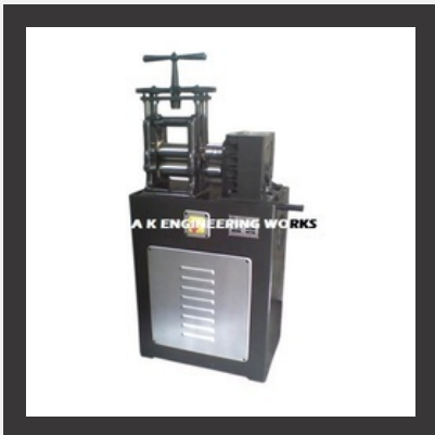
Single Head Sheet Rolling Mill