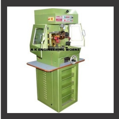
Double Head Chain Cutting Machine