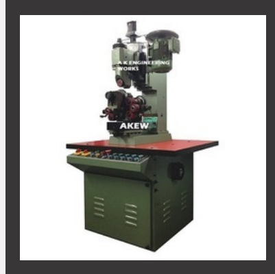
Computerised Automatic Chain Cutting / Faceting Machine