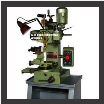
Double Head Bangle Ring Faceting Machine