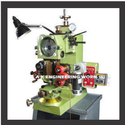
Chain Faceting Machine