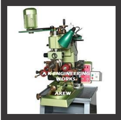
Single Head Vertical Chain Diamond Cutting Machine