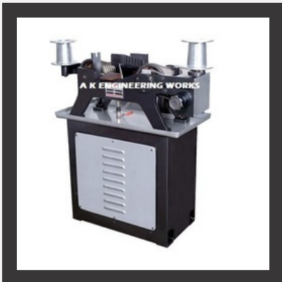
Jewellery Wire Drawing Machine