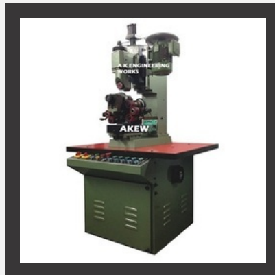
Chain Diamond Cutting Machine for Jewellery Industry