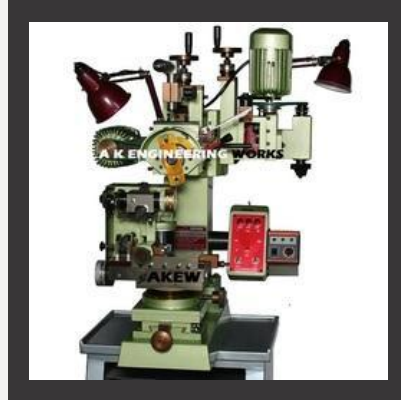
Double Head Bangle Faceting Machine